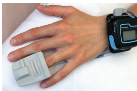
SpO 2 sensor, attached for the night

Thanks to ECG-derived respiration recording, the medilog®AR is able to screen for potential respiratory episodes during sleep. The optional SpO 2 sensor, connected via Bluetooth, allows for additional respiratory information.