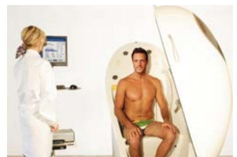
Simple and easy for both subject and operator