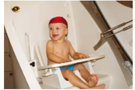
The Pediatric Option™ accessory allows for easy body composition assessment of young children

The BOD POD with the Pediatric Option™ accessory allows for the assessment of body composition of young children. It includes a customized seat insert to create a safe and comfortable testing environment for subjects between 2 and 6 years of age. A modified Windows®-based software program and calibration standard are part of the testing procedure as well. This option is validated for subjects as young as 2 years of age and as small as 12 kg 2 .