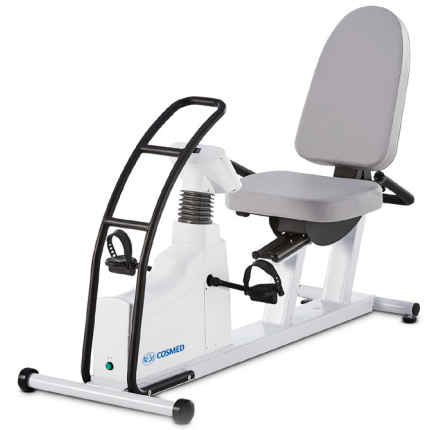
A sturdy support bracket made of tubular steel gives patients a secure hold while moving on and off the E600 ergometer.