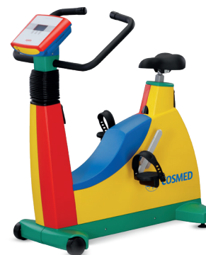
The colorful design of E150 Pediatric relieves children of their fear of the “medical device”.