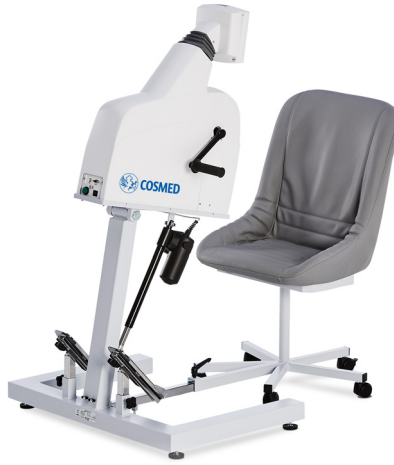
The E400 special attachment for wheelchairs guarantees safe front-wheel locking – with variable distance to the ergometry unit.