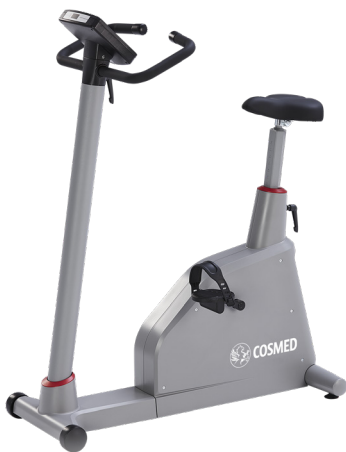
The Optibike Plus ergometer offers a wide range of expansion options.