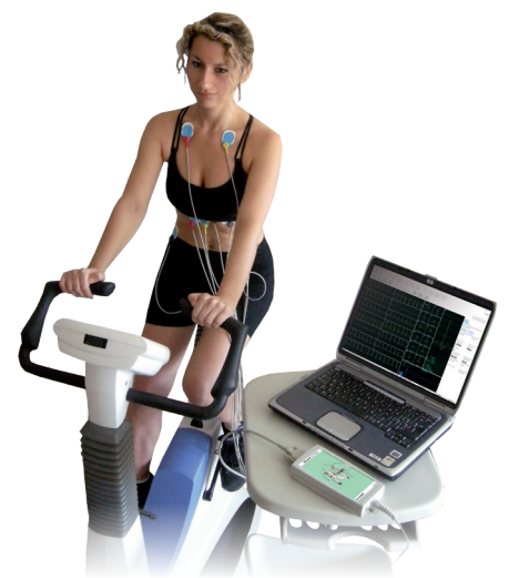
Full interface with COSMED Cardio Pulmonary Exercise Testing equipment.