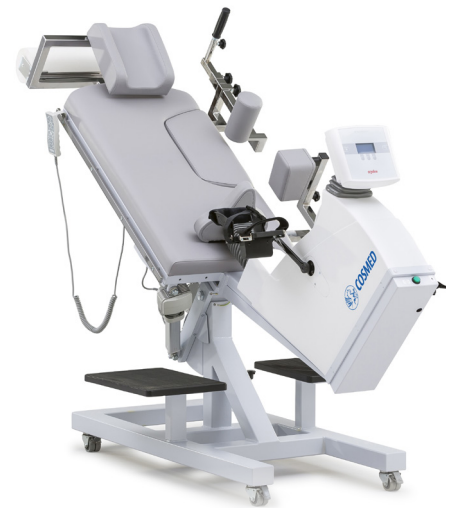
E1200, the classic tilt-recline ergometer for dynamic stress echocardiography examinations.